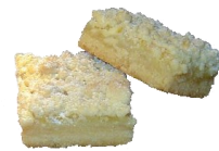
OLD FASHIONED LEMON BAR item#115

Sold By 1/2 Doz Price: 1.10/pc Shelf Life 4 Days Refrigeration Optional