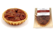
GF 4" PECAN TART Item#779

Sold By 1/2 Doz Price $1.50/ea Shelf Life 5 Days Optional Refrigeration