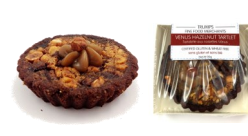
GF 4" VENUS HAZELNUT TART item#781

Sold By 1/2 Doz Price $2.00/ea INDIVIDUALLY WRAPPED-item#780 Sold By 8/box Price $2.20/ea Shelf Life 5 Days Refrigeration Optional