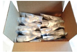
14 bags in a case

All flavours are $52.50 / case Mix flavours okay, call us today to place your order!