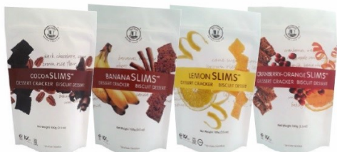
100g (3.5 oz.) in a bag

Made in Canada! No MSG or Trans Fat! Great as a snack on the go! 12-18 Months Shelf-stable!