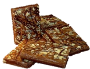
BIG BELGIAN BROWNIE item#101

Sold By 1/2 Doz Price: 1.20/pc Shelf Life 4 Days Refrigeration Optional