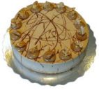
DULCE DE LECHE CHEESECAKE item#504

Portions Cut 14 Price: 16.95 Size: 8" Shelf Life 3 Days Must Refrigerate