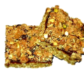
DATE BAR item#106

Sold By 1/2 Doz Price: 1.00/pc Shelf Life 3 Days Must Refrigerate