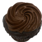
GF VEGAN CHOCOLATE CUP CAKE item#772

Sold By 1/2 Doz Price $1.50/ea Shelf Life 5 Days Optional Refrigeration