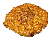
OMEGA 3 BREAKFAST item#309

Sold By 1/2 Doz Price: 1.00/pc Shelf Life 4 Days Do Not Refrigerate