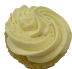
GF VEGAN LEMON CUP CAKE item#774

Portion Cut 9 Price $9.90 INDIVIDUALLY WRAPPED-item#156 Sold By 8/box Price $1.30/ea Shelf Life 5 Days Refrigeration Recommended