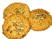
KITSILANO OATMEAL item#306

Sold By 1/2 Doz Price: 1.00/pc Shelf Life 4 Days Do Not Refrigerate