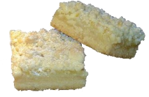
OLD FASHIONED LEMON BAR item#115

Sold By 1/2 Doz Shelf Life 4 Days Refrigeration Optional