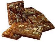
BIG BELGIAN BROWNIE item#101

Sold By 1/2 Doz Shelf Life 4 Days Refrigeration Optional