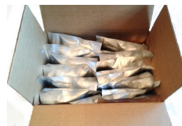
14 bags in a case

Mix flavours okay, call us today to place your order!