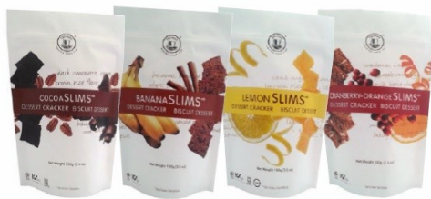
100g (3.5 oz.) in a bag