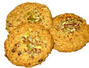
KITSILANO OATMEAL item#306

Sold By 1/2 Doz Shelf Life 4 Days Do Not Refrigerate