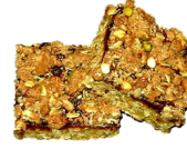
DATE BAR item#106

Sold By 1/2 Doz Shelf Life 3 Days Must Refrigerate