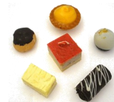
PETIT FOURS item#801 Sold By 3 dozen/box Shelf Life 3 Days Must Refrigerate